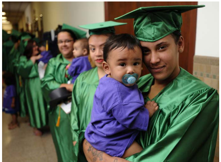
Healthy Families participants before their graduation at MSPCC Holyoke