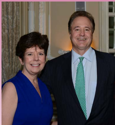
Upper Right: Guests enjoying our Fund-A-Cause!