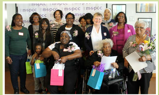
An inspiring Wisdom Weavers event was held to celebrate the dedicated grandparents and caretakers in our KINnections program.