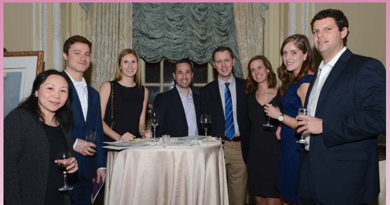
Lower Right: Supporters from Breckinridge Capital Advisors.