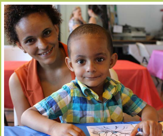
Congratulations to our Healthy Families participants and staff for another set of successful graduation ceremonies!