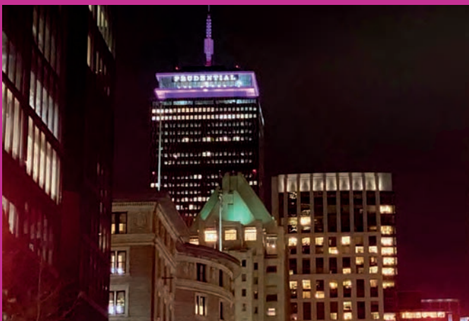
The Prudential Tower lit purple on December 12th in support of MSPCC during its annual 31 Nights of Light initiative.

The holidays can be an especially difficult time for families facing financial insecurity, housing instability, loss, or mental health challenges. Each holiday season MSPCC staff works tirelessly to fulfill holiday wish lists for hundreds of eager children to ensure that every child can have a joyful holiday season regardless of their circumstances. Although the pandemic has posed additional challenges for our annual holiday drive, we were able to fulfill the holiday wishes of more than 315 children this year. Thank you to all of our generous individual and corporate supporters for making the holidays bright for hundreds of children.