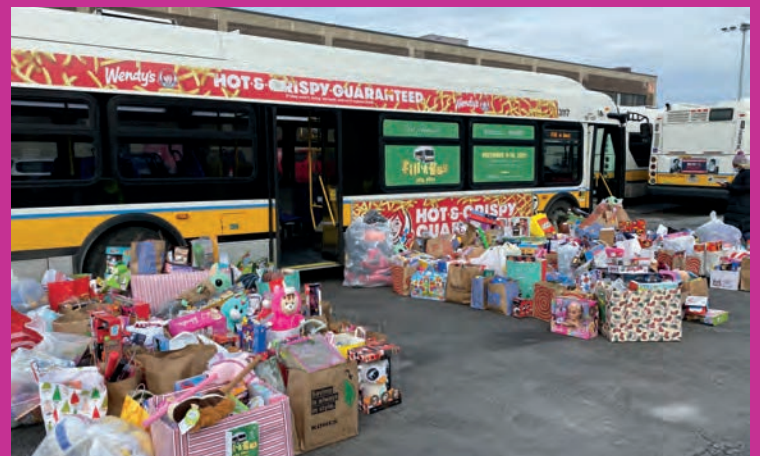
An MBTA bus filled with more than 2,000 toys for MSPCC and other local charities for their 21st annual Fill-A-Bus.